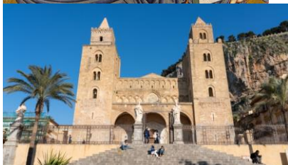
Cathedral of Cefalù in Sicily