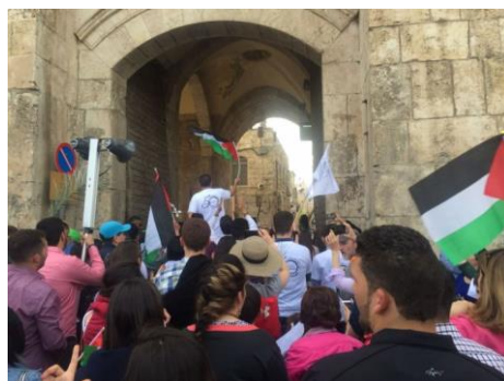
Walking in the footsteps of Jesus on Palm Sunday