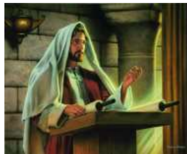
Luke 4: 18-21 - Isaiah 61 fulfilled